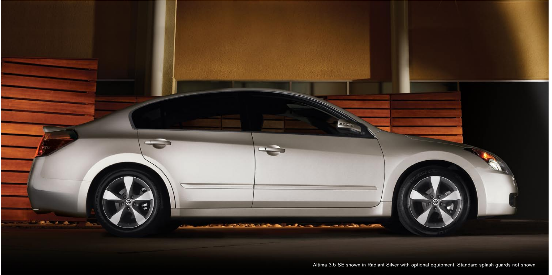
Altima 3.5 SE shown in Radiant Silver with optional equipment. Standard splash guards not shown.